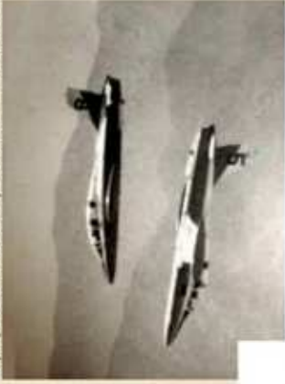
Equipo acrobático peruano - DIABLOS ROJOS