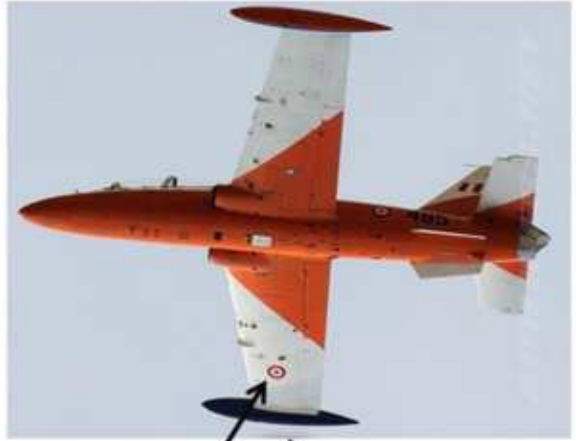
MEINDERT DESIGNER DECALS

demo jet probably no roundels medium blue tank inside (not black)